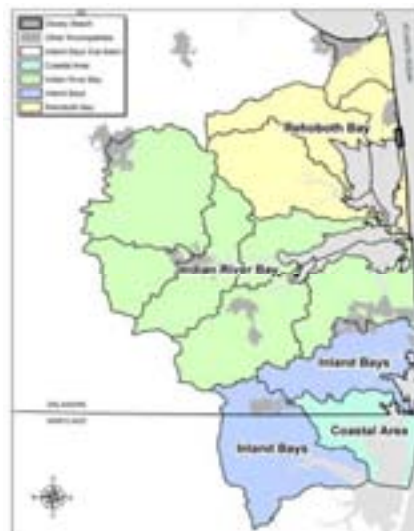
Figure 2: Inland Bays Sub-Basins

There are four major drainage basins in Delaware, and Dewey Beach is located within the Inland Bays Basin, as shown below in Figure 2. The Inland Bays Basin is about 314 square miles in size, or 200,702 acres, and is divided into four sub-basins. Dewey Beach is located within the Rehoboth Bay Sub-Basin, consisting of the Lewes-Rehoboth Canal watershed (north Dewey Beach) and Rehoboth Bay watershed.