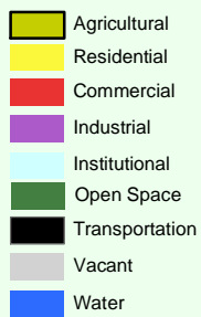
Map 4. Current Land Use Town View